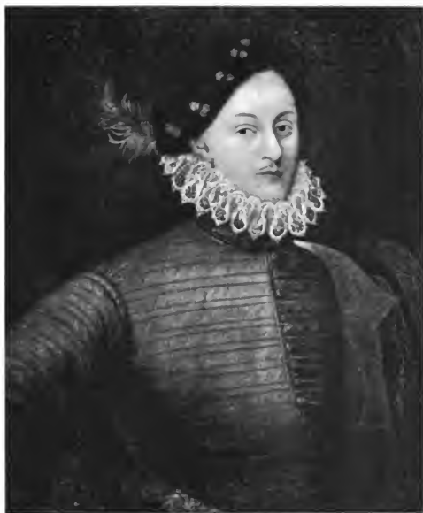
EDWARD DE VERE, SEVENTEENTH EARL OF OXFORD—AGE 25 FROM THE PORTRAIT AT WELBECK ABBEY. REPRODUCED BY PERMISSION OF HIS GRACE THE DUKE OF PORTLAND.