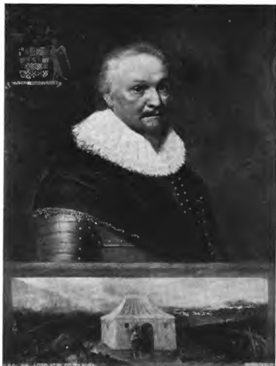
HORACE, LORD VERE OF TILBURY, FROM A PHOTOGRAPH FROM THE PORTRAIT BY M. J. VAN MIERVELDT IN THE NATIONAL PORTRAIT GALLERY, BY PER- MISSION OF EMERY WALKER, LIMITED.