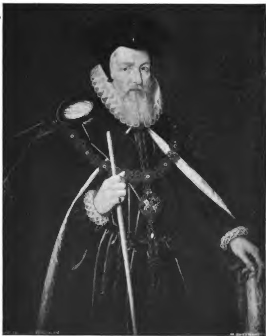
WILLIAM CECIL, FIRST LORD BURGHLEY, K.G., FROM THE PORTRAIT IN THE NATIONAL PORTRAIT GALLERY, ATTRIBUTED TO M. GHEERAEDTS, FROM A PHOTOGRAPH BY EMERY WALKER, LIMITED.