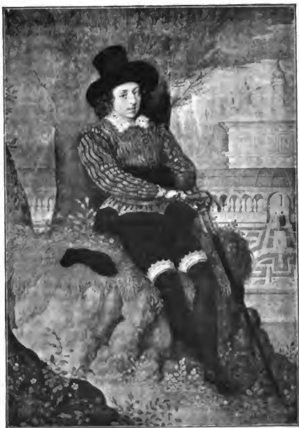
SIR PHILIP SIDNEY, FROM THE MINIATURE BY ISAAC OLIVER AT WINDSOR CASTLE.